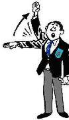
WAZA-ARI Awasete IPPON