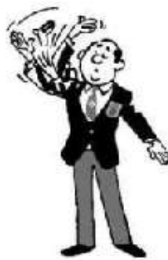
CHANGE OF SCORE